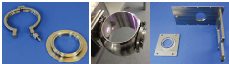
1. Mounting Flange

3. Mounting Panel is a flexible and easy-to-use mounting option for conveyors and other flat surfaces.