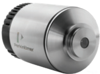
DA 7350 In-line NIR Instrument

RELIABLE ACCURATE REAL-TIME AGRI AND FOOD MEASUREMENT