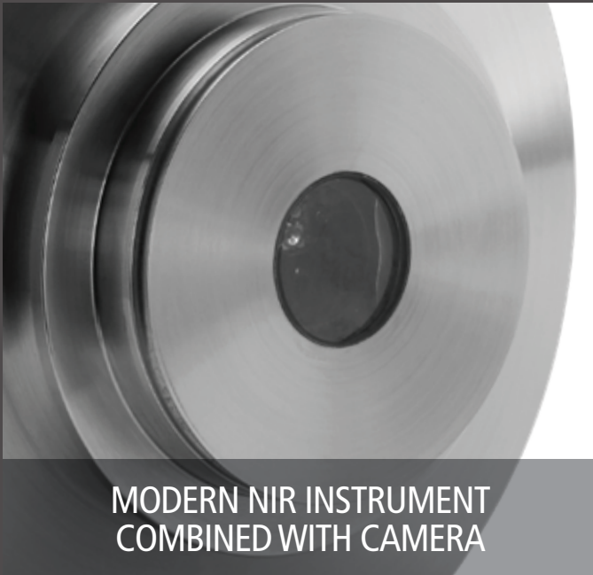
MODERN NIR INSTRUMENT COMBINED WITH CAMERA