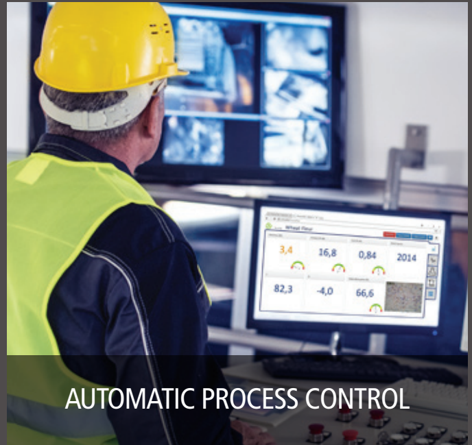
AUTOMATIC PROCESS CONTROL